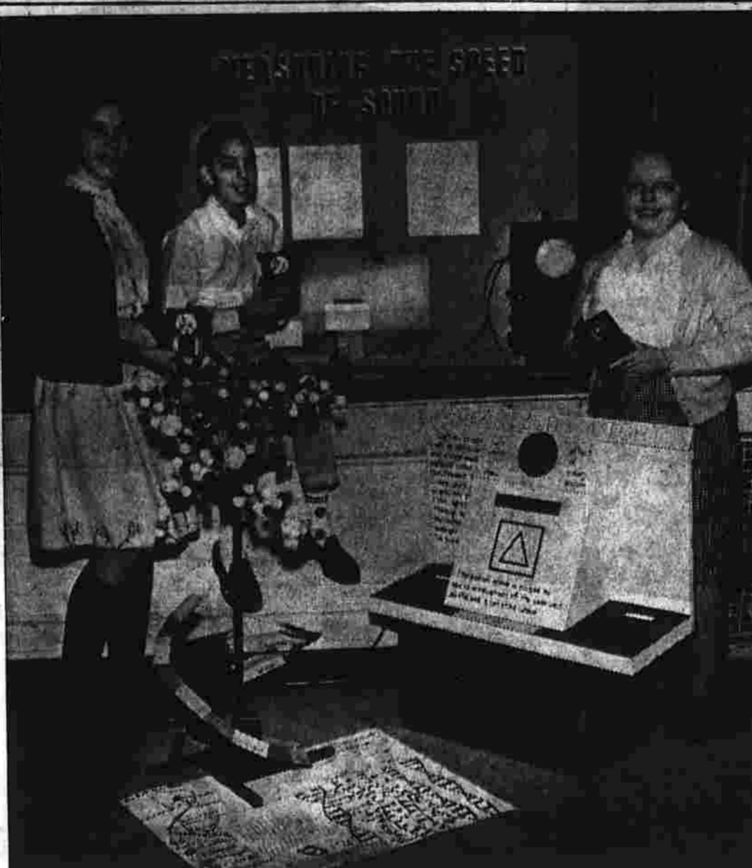
Bennet Science Fair Winners Named