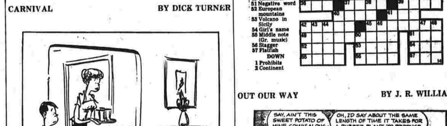
CARNIVAL BY DICK TURNER