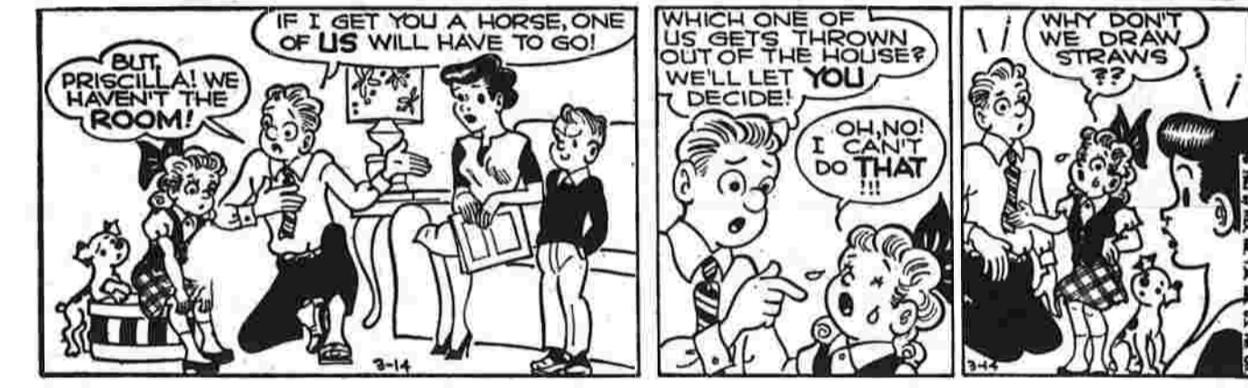
BONNIE BY JOE CAMPBELL