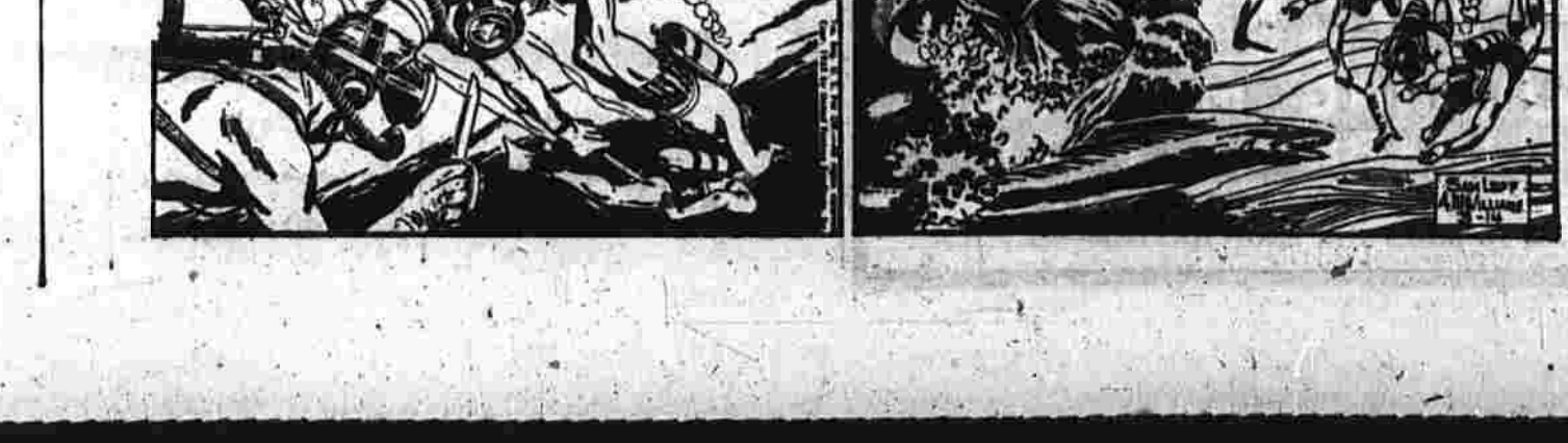
DAVY JONES