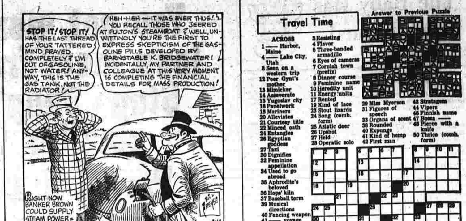
OUR BOARDING HOUSE with MAJOR HOOPLE