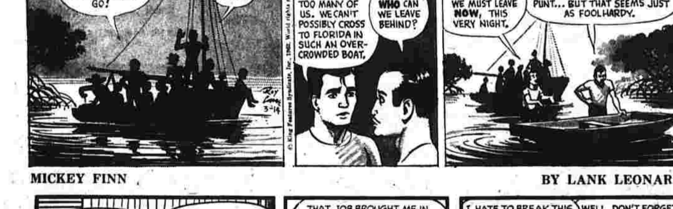
MICKY FINN BY LANK LEONARD